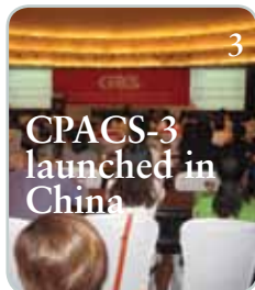
CPACS-3 launched in China